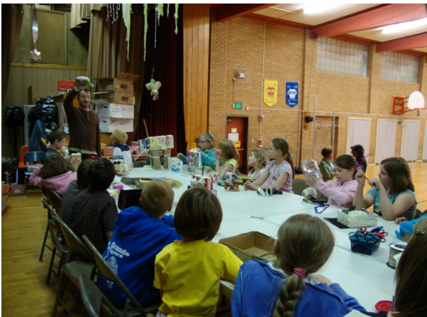
Central Elementary School Residency on Puppet Making

Since 1982, ArtsEast has contracted with regional schools and communities in the ten eastern counties ( Baker, Gilliam, Grant, Harney, Malheur, Morrow, Umatilla, Union, Wallowa, and Wheeler ) to provide week-long arts learning experiences. We work with over twenty artists with expertise in visual and literary arts, music, dance and theatre. Artists have teaching experience and develop classes based on Oregon Department of Education Arts Content Standards.