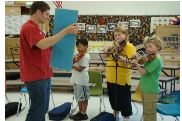
Green Strings Violin Lessons

Special projects in 2010-11 included NEST FEST with the Union County Art and Culture Center and Oregon Department of Fish and Wildlife, COWBOY GEAR, An Exhibit of Functional Western Arts and Crafts and sponsorship of the Grande Ronde Western Arts Festival .