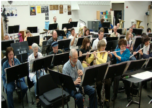
EOU Community Symphonic Band Rehearsal

ArtsEast also collaborates and serves as a resource for local organizations such as the Union County Arts and Cultural Center, the Union County Cultural Coalition and the Union County Juvenile Drug and Alcohol Court.