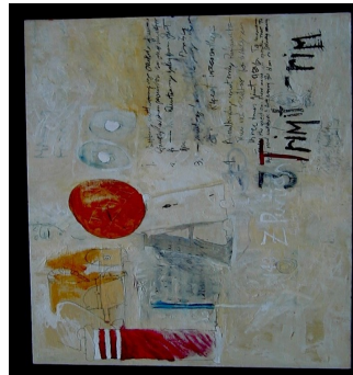
BD-W-2 by James Dumble Artist of Eastern Oregon 2010 Honored Artist